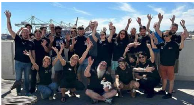
B Shed Builds