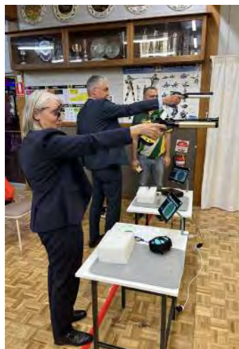
Ambassador of the Federal Republic of Germany H. E. Beate Grzeski visits the Rhein-Donau Club!