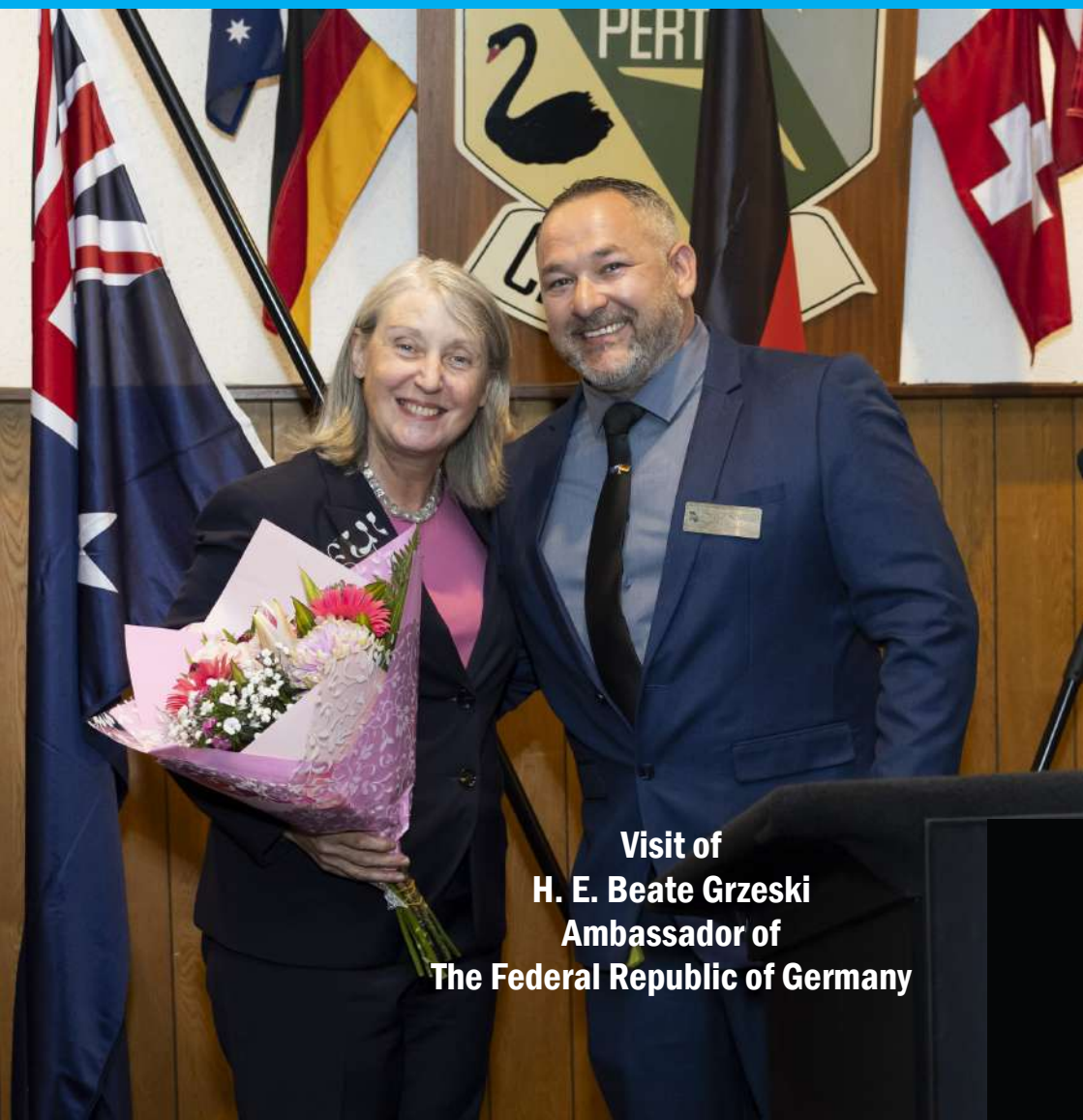
Visit of H. E. Beate Grzeski Ambassador of The Federal Republic of Germany